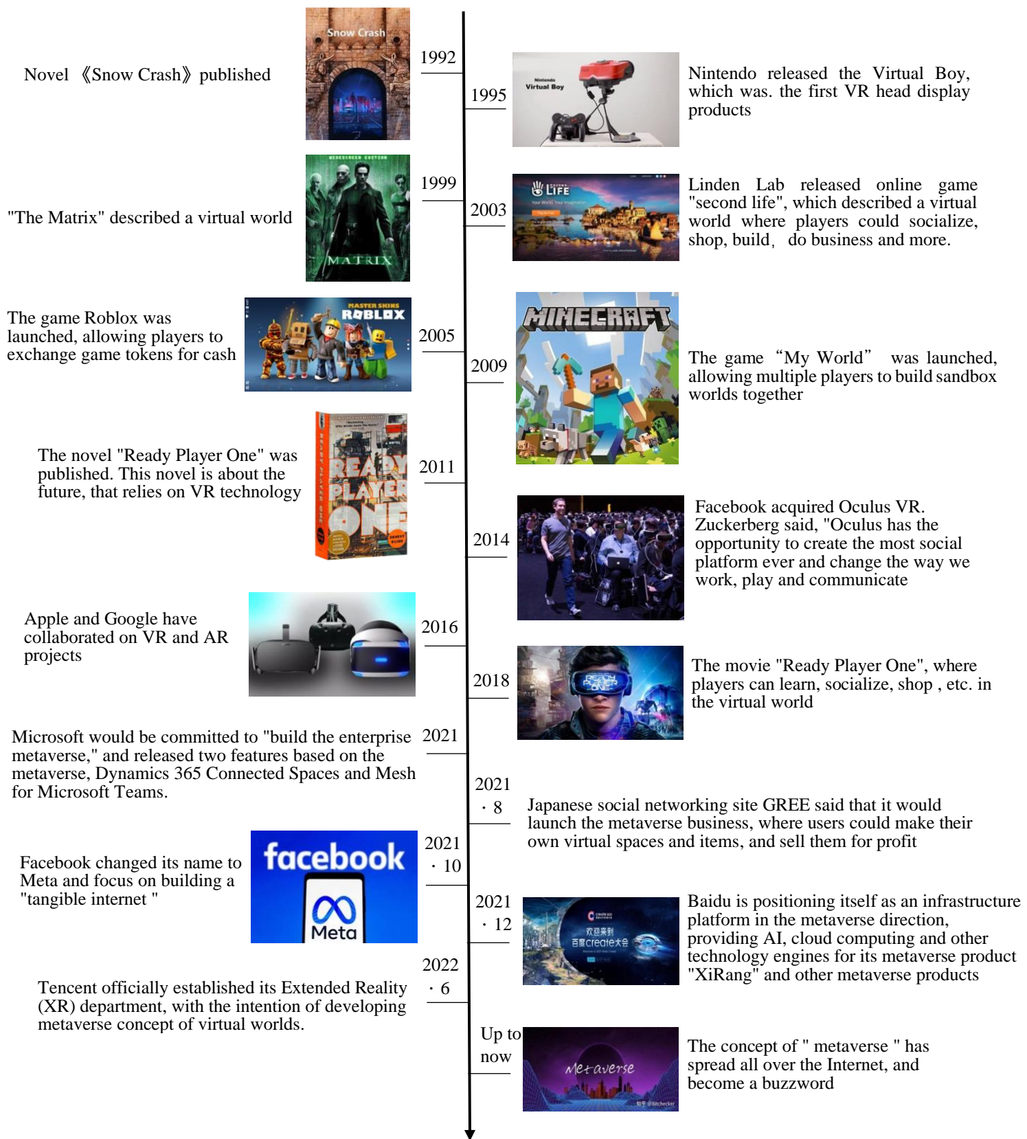
Figure 1: Development timeline of the Metaverse